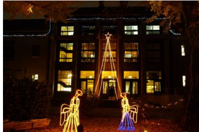
A view of the front of Luther High School.

A HUGE thank you to the many congregations, families and individuals who bought, sorted, prepared, packed and sent off Christmas lights for the annual Illumination Ceremony that was held at Luther campus in Kumamoto this past week. The lights were received with delight and perhaps no one was more appreciative than the custodians, who had the pleasure of stringing together lights that they could feel confident would WORK! Altogether, the donations totaled over 4,000 lights (that's individual lights) that you contributed. The sounds from those who gathered reminded me of the "oohs" and "aahs" of Fourth of July fireworks.